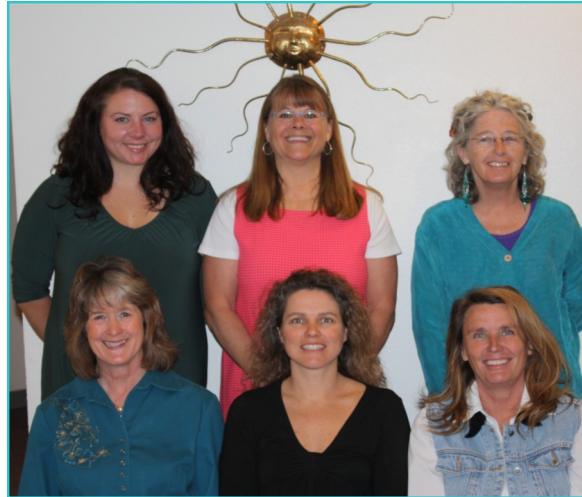
Our Options for Long Term Care program Team San Juan Basin Health Department (State-designated Single Entry Point agency)

We assist individuals, families, and caregivers in evaluating options and establishing and maintaining a comprehensive care plan tailored to maximize independence while meeting the specific needs of individuals and utilizing each person's unique strengths, abilities and personal choices.